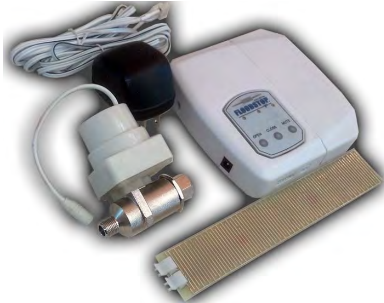
Dishwasher, Ice Maker and Toilet FS3/8C 3/8" Compression Fittings

(800) 553-5573 Phone (608) 850-5558 Fax www.statewidesupply.com